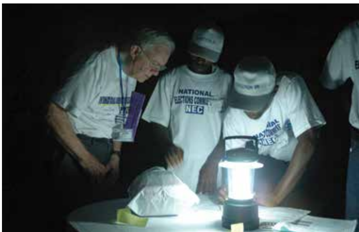
In Liberia, President Carter watches ballot counting by lantern light in 2005.

I think the election in Zambia was one of the most emotional for me. We had an assistant from South Africa. South Africa still had an apartheid government, and the black people had not been permitted to vote for many generations. The assistant who was helping me monitor the election was a very distinguished member of the African National Congress, which was a black part of South Africa's government. We went into a place, kind of like a basketball arena, and there were a number of voting tables. When we walked in and looked around, he began to weep. I asked him why he was crying. He said he was 54 years old and this was the first time he'd ever seen anybody vote. I got emotional, too.