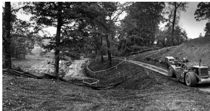
When the Carter Center's headquarters was built in an Atlanta park in the mid-1980s, no one knew the global impact the organization would someday have.

Through their leadership, the Carters have built an institution prepared to continue waging peace, fighting disease, and building hope for millions of the world's poorest people into the distant future. For years, President and Mrs. Carter have been mindful of securing a long-term, sustainable future for this unique institution.