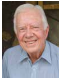
Former U.S. President Jimmy Carter

Last May in Guyana, The Carter Center celebrated its 100th election observation mission. In this Q&A, former U.S. President Jimmy Carter, who led the Center's first election mission to Panama in 1989 and 38 of the 99 that followed, discusses three decades of elections, remembering ones that made history, ones that put his life in danger, and one that brought tears to his eyes.